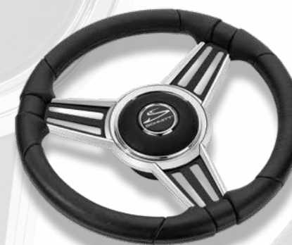
#PU301404-44 Black polyurethane, black spoke, chrome trim, highlights and cap, 3/4" tapered hub.

14" [360mm] diameter, black polyurethane, black or brushed spoke, and flexibility to customize wheel sectors, spoke inserts and center cap, 3/4" tapered hub or optional spline hub. Custom colors require a minimum commitment.