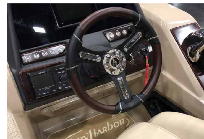
Torcello Series 05 #PU0511B4-12