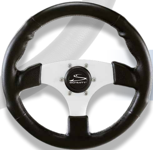
#PU013104 Brushed spoke and black plastic cap (CCIT)

The 13.5" [350mm] Fantasy wheel features an all polyurethane grip, 3/4" tapered hub or optional spline hub, and plastic center cap.