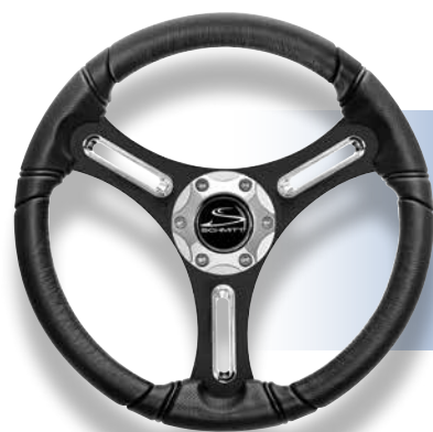
#PU031104-12 Black spoke, chrome spoke trim, chrome scallop cap and 3/4" tapered hub.