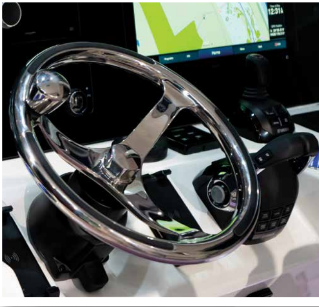
Primus #7421321FGK Photo courtesy of: SÔLACE Boats by Stephen Dougherty Florida