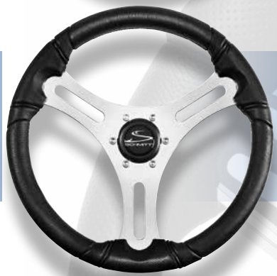
#PU035104-01 Polished spoke, no spoke trim, black plastic cap and 3/4" tapered hub.