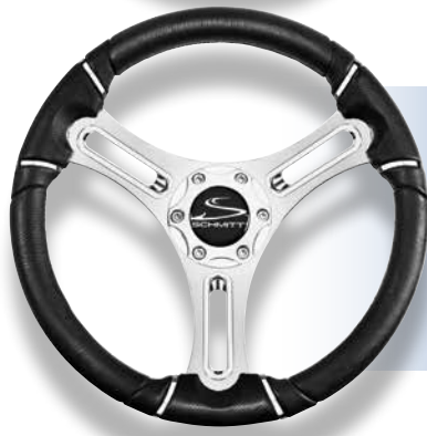
#PU045144-12 Polished spoke, chrome spoke trim, rim trim, scallop cap and 3/4" tapered hub.