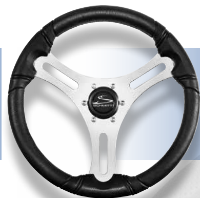
#PU033104-01 Brushed spoke, no spoke trim, black plastic cap and 3/4" tapered hub.