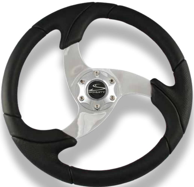
#PU025104 Polished spoke shown with optional chrome ABS scallop cap (CAP0103)