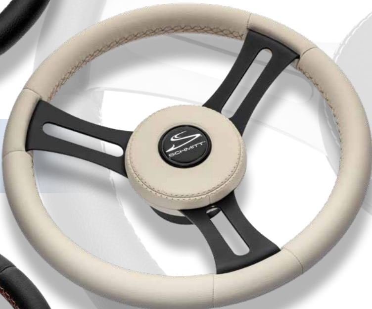
#PU081B11 Biege leather wrapped with white stitching and black spoke