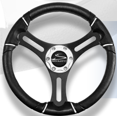
#PU041144-02 Black spoke, no spoke trim, chrome rim trim, scallop cap and 3/4" tapered hub.