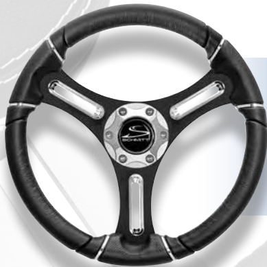
#PU041144-12 Black spoke, chrome spoke trim, rim trim, scallop cap and 3/4" tapered hub.