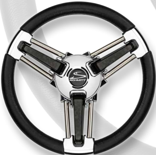
#PU1051B1-04 Black Pearlwood