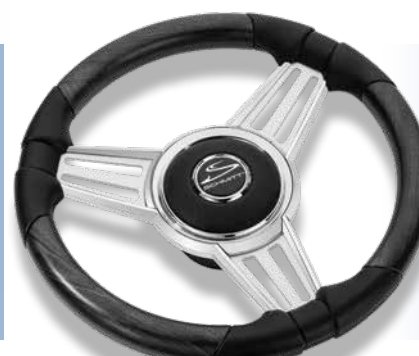
#PU3234D4-44 Black polyurethane, greywood sectors, brushed spoke, chrome trim, highlights and cap, 3/4" tapered hub.