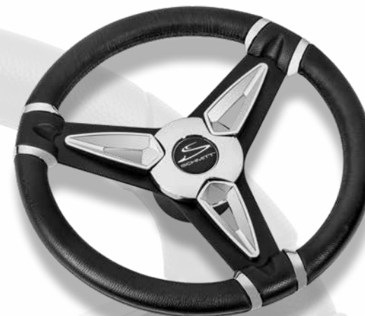
#PU501404 Black polyurethane, black spoke, chrome trim, and center cap.

Ruggedly built for use in fresh or saltwater, the three spokes of the 14" [360mm] diameter PU50 wheels are offered in a satin brushed or matte black anodized aluminum finish. The all-weather black polyurethane grip has the look and feel of genuine leather, and delivers a solid, quality grip. Chromed trim sections provide a soft transition between the wheel and spokes for all-day comfort. Available with 3/4" tapered or optional splined hub.