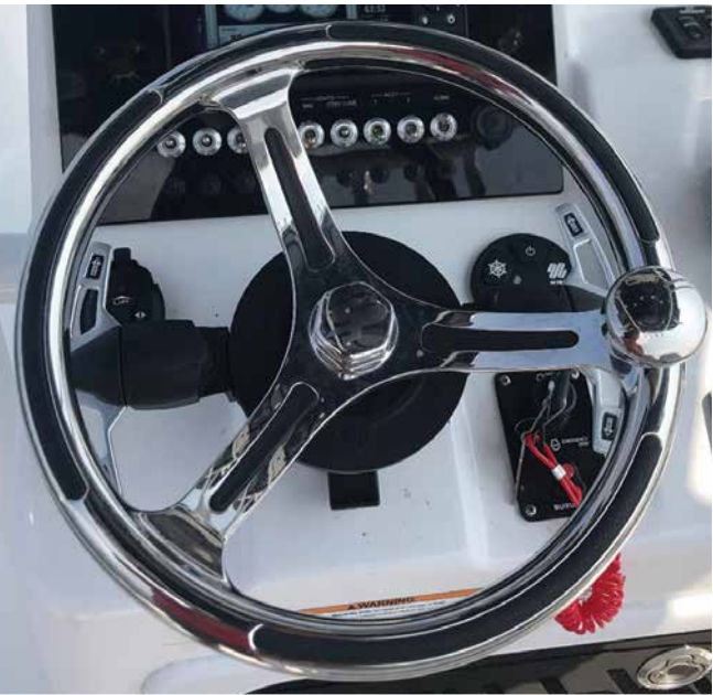
Primus #7401321FGK