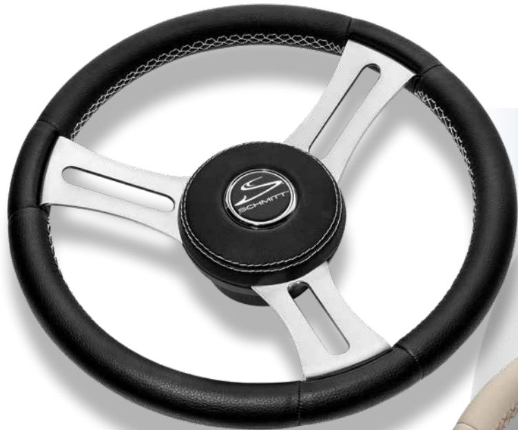
#PU085241 Black leather wrapped with white stitching and polished spoke

The 14" [360mm] Torcello Elite conveys luxury and style on any boat. The wheel is luxuriously wrapped in hand-stitched marine-grade synthetic leather and the driver will appreciate the exceptional feel and comfort of the grip. Designed to be customized in quantity to match virtually any boat interior, the Torcello Elite can be manufactured in an endless array of leather and stitching color combinations. The three thick aluminum spokes are available in polished or black anodized finishes to enhance the decor and a choice of attractive center caps are offered. Available with a 3/4" tapered or optional spline hub.