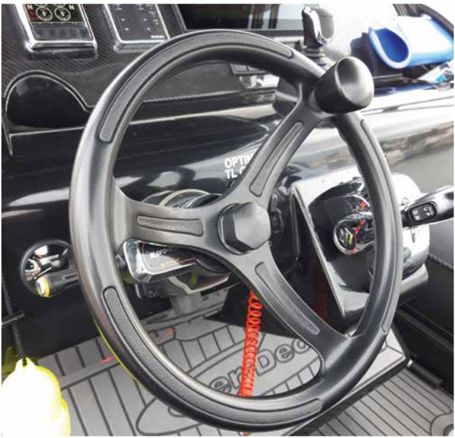
Powder Coated Primus #740132BFGK