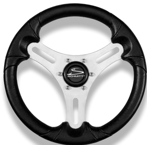
#PU063104-01 Satin silver spoke, black plastic cap and 3/4" tapered hub.

The 13" [330mm] Torcello Lite provides a sure, solid command of the helm. This exceptional yet economical wheel features three satin silver or black anodized aluminum spokes with stylish cut-outs. The ergonomic grip is cowhide leather-textured black polyurethane with accent areas having the look of perforated leather. The black center cap can be upgraded to chrome ABS for an additional charge.