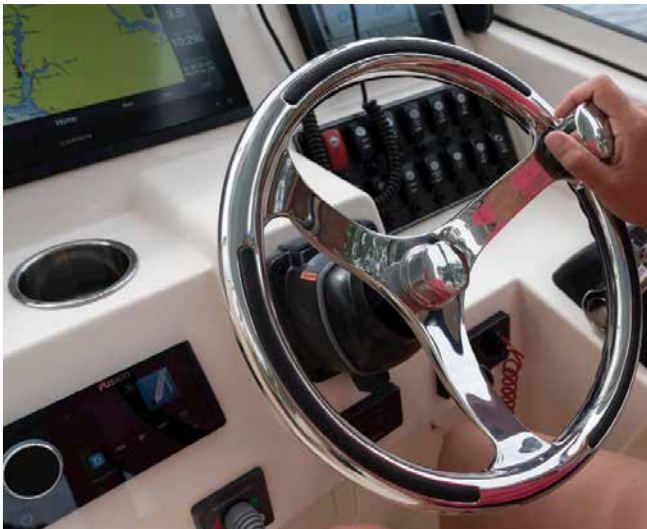
Primus #7421321FGK