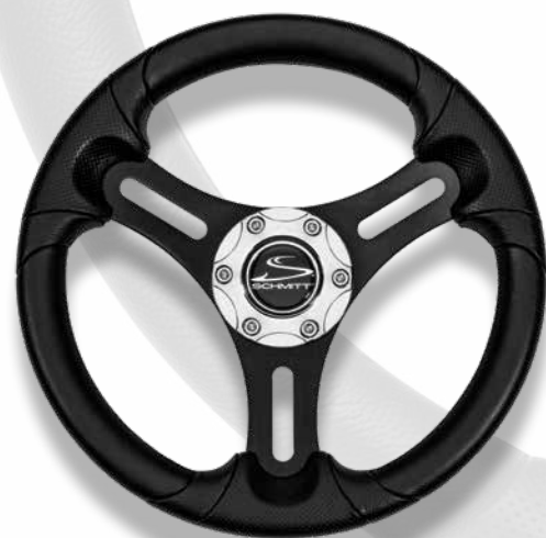
#PU061104-02 Black spoke, chrome scallop cap (optional) and 3/4" tapered hub.