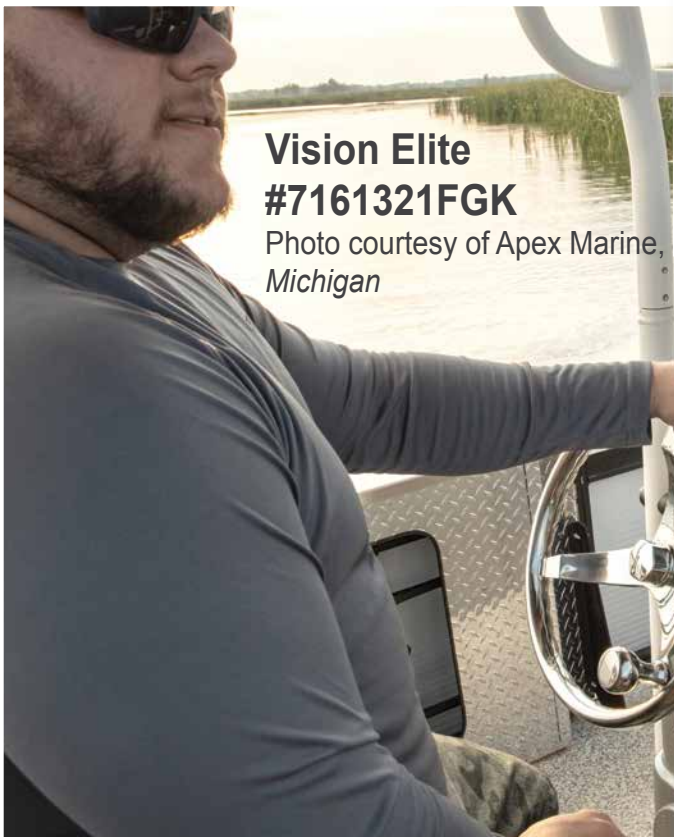
Vision Elite #7161321FGK