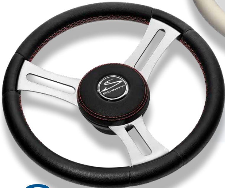
#PU085341 Black leather wrapped with red stitching and polished spoke