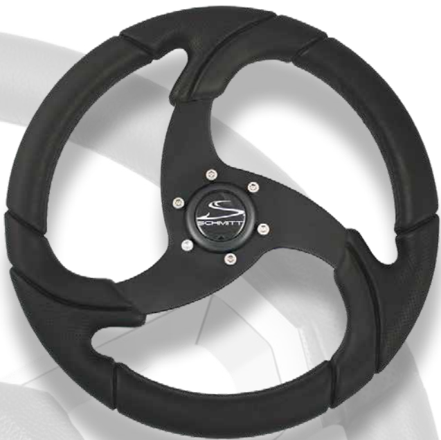
#PU021104 Black spoke and black plastic cap (CCIT)

The 14" [360mm] Folletto wheel features an all polyurethane grip, 3/4" tapered hub or optional spline hub, and black plastic center cap (CCIT).