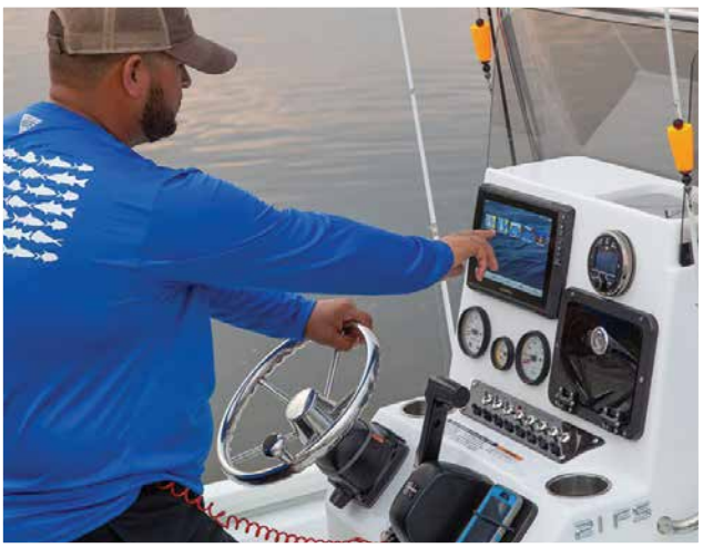
Destroyer 5-spoke #1731321FGK