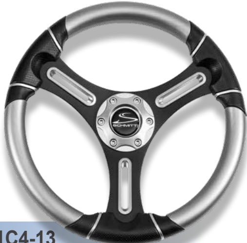
#PU0511C4-13 Black spoke, matte silver spoke trim, rim trim, scallop cap, silver wheel sectors and 3/4" tapered hub.