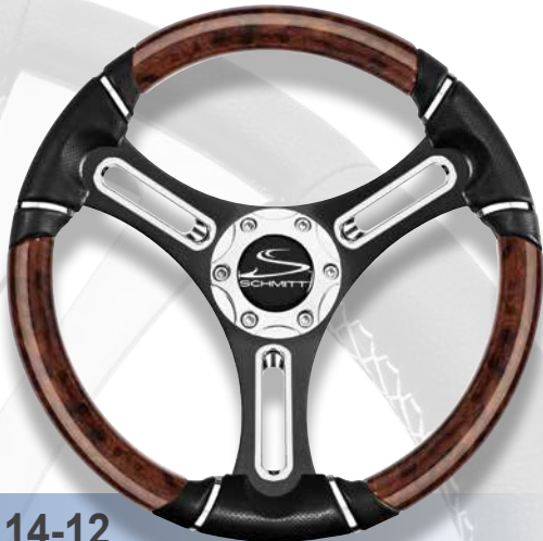
#PU051114-12 Black spoke, chrome spoke trim, rim trim, scallop cap, burl wheel sectors and 3/4" tapered hub.