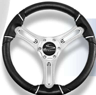
#PU043144-12 Brushed spoke, chrome spoke trim, rim trim, scallop cap and 3/4" tapered hub.