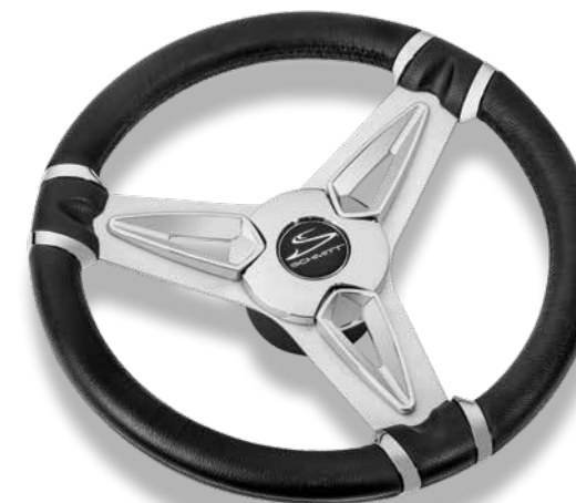
#PU503404 Black polyurethane, brushed spoke, chrome trim, and center cap.