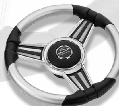
#PU3214F4-44 Black polyurethane, silver satin sectors, black spoke, chrome trim, highlights and cap, 3/4" tapered hub.