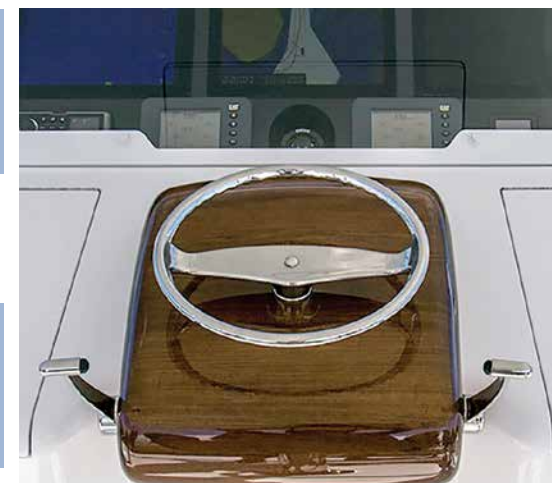
Ongaro yacht wheel and control arms shown on a 44' Viking Convertible.