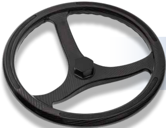
Carbon Fiber Primus #7451321FGK • with control knob #7451321FG • no control knob (shown)