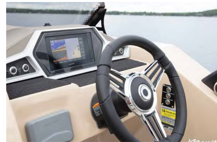
Model 30 #PU301404-44