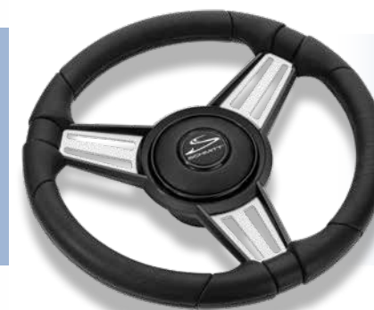
#PU303104-11 Black polyurethane, brushed spoke, black trim, highlights and cap, 3/4" tapered hub.