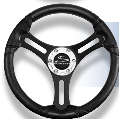
#PU031104-02 Black spoke, no spoke trim, chrome scallop cap and 3/4" tapered hub.